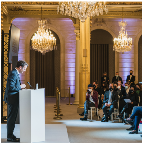
Monsieur Emmanuel MACRON President of the French Republic Speech given at the prize-giving ceremony

“ Le FRENCH DESIGN 100 is an annual event for an entire profession: a real celebration, a key moment driven by French design. Not only does it celebrate the 100 best French design and interior architecture projects worldwide, but it also pays tribute to the entire ecosystem of designers, manufacturers and unique skills that are so essential to our French art of living.”